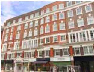
THURLOE COURT SW3 6SB 2 bedroom flat £895 pw