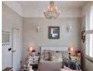
FULHAM ROAD SW10 9EL 1 bedroom apartment £375,000

If you are looking to buy, sell, rent or let in or around London, our online database will help you to find the ideal property. Also, landlords can discover the comprehensive range of services we offer as London's leading letting specialists.