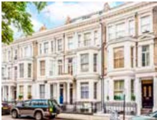
EDITH GROVE SW10 0NH 2 bedroom flat £625,000