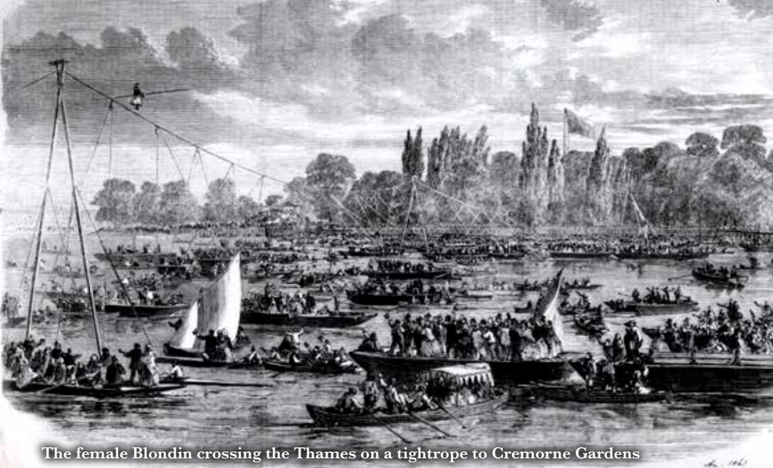
The female Blondin crossing the Thames on a tightrope to Cremorne Gardens

and a pub named the Balloon Tavern was opened within the Gardens (the premises is now the Lots Road pub). Most bizarrely, in June 1874 Vincent de Groof, known as L'Homme Volant , jumped from a balloon at 500 ft in a bat-like contraption of ropes, pulleys and silk wings. His intention was to flap/glide down to earth; sadly, the theory didn't work in practice and de Groof crashed onto Sydney Street and broke his neck.