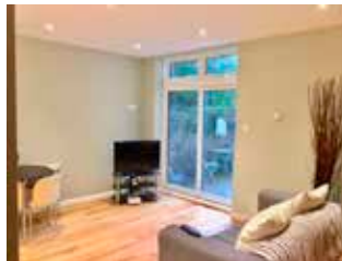
FINBOROUGH ROAD SW10 9EG 2 bedroom flat £385 pw