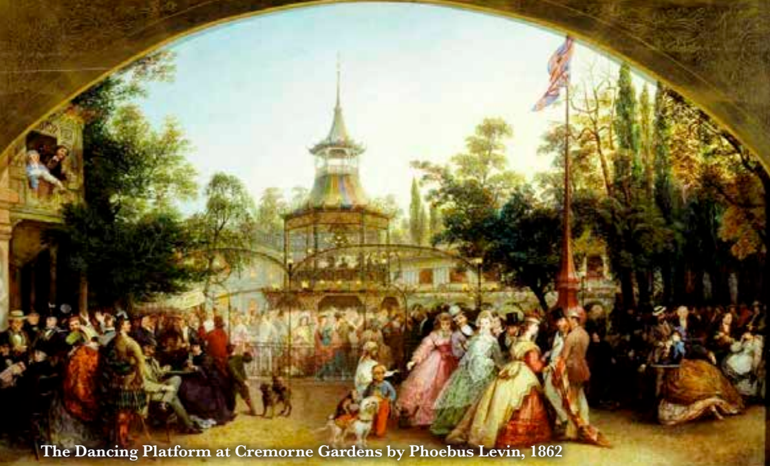
The Dancing Platform at Cremorne Gardens by Phoebe Levin, 1862