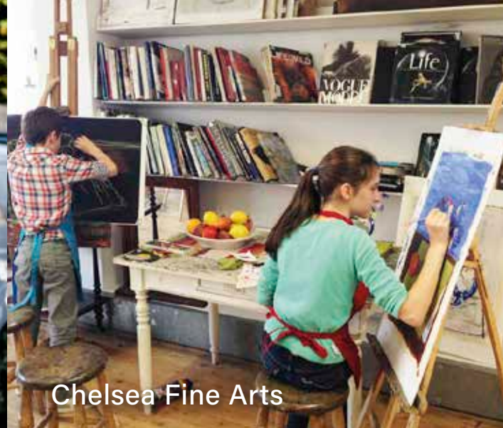
Chelsea Fine Arts

Advertorial | Read online: keepthingslocal.com | #hammersmithlocals | #theitalianplumberuk