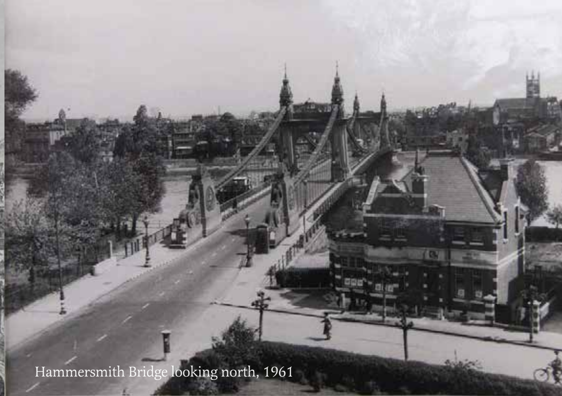
Hammersmith Bridge looking north, 1961