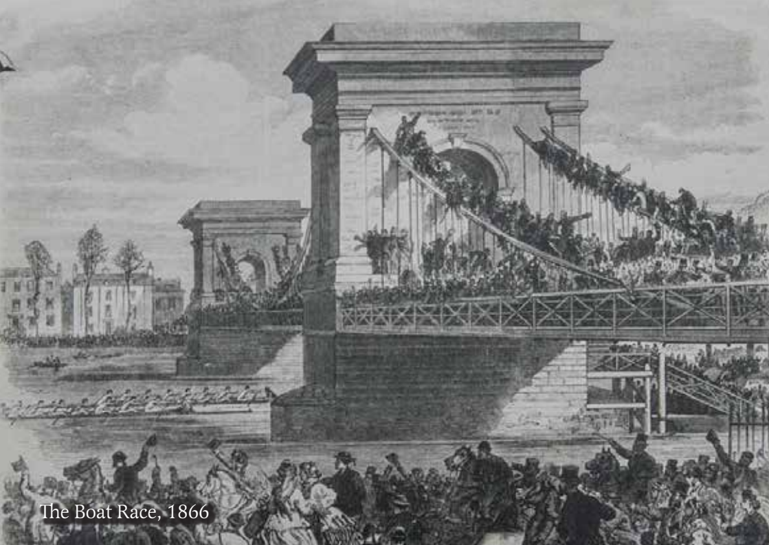
The Boat Race, 1866