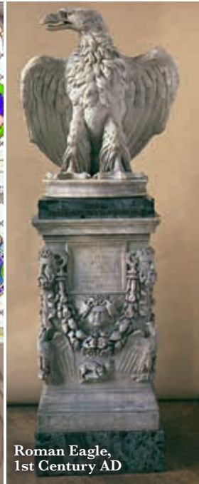
Roman Eagle, 1st Century AD