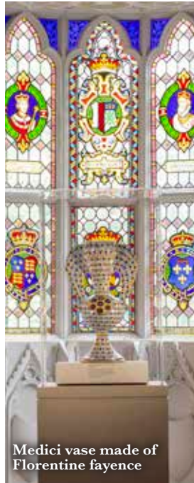
Medici vase made of Florentine fayence