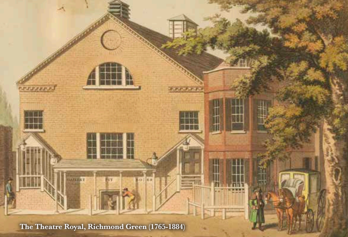
The Theatre Royal, Richmond Green (1765-1884)