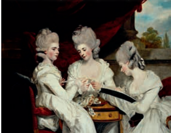
The Ladies Waldegrave by Sir Joshua Reynolds